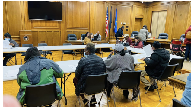
Open Application events were held at City Hall on December 3 and December 10 to assist citizens with Phase I-Furnaces