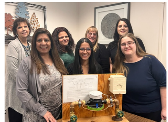
Customer Accounting Team: